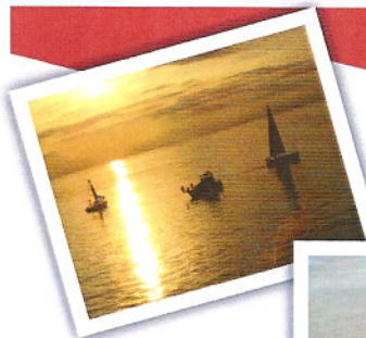
Wednesday Night Races