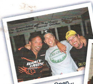
Our Club is Open...